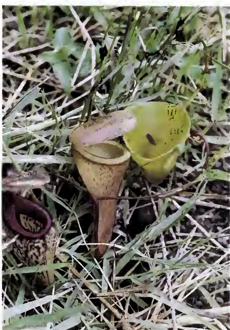
N. spectabilis (left) N. bongso x N. inermis (middle) N. inermis (right)